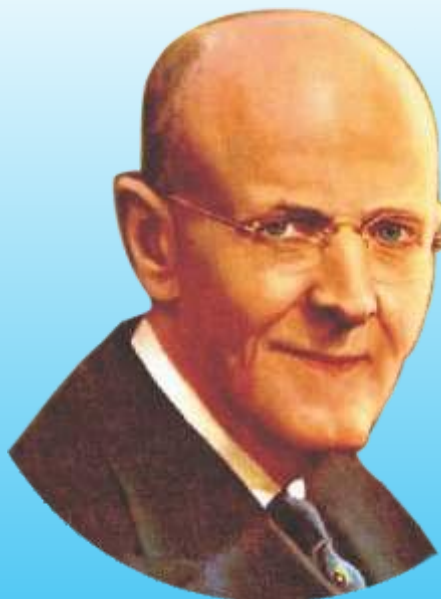
Founder Rtn. Paul P. Harris

R. I. Dist.: 3170 Club No.15648 Chartered: 23-Feb 1972